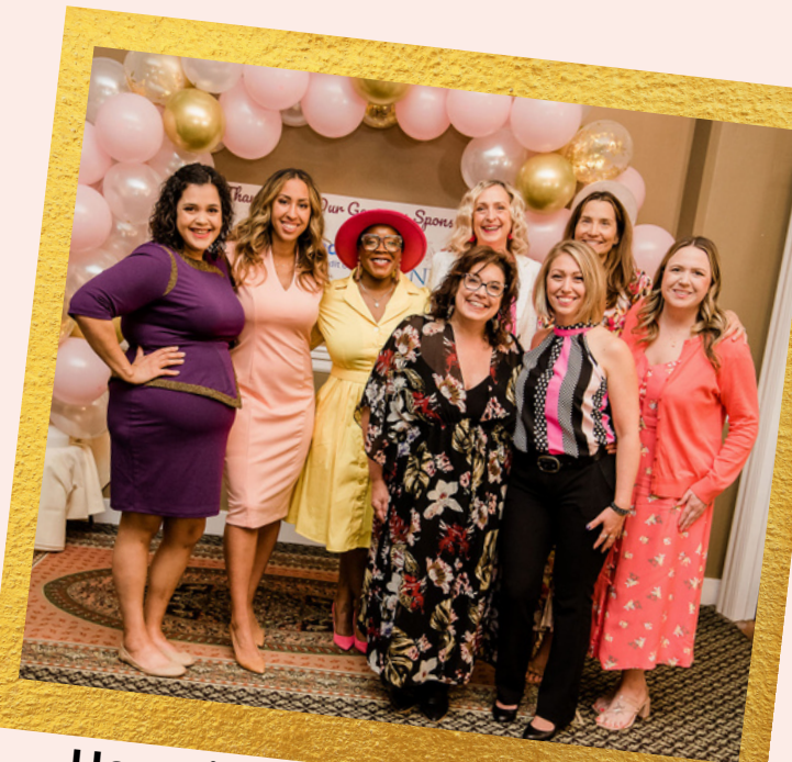
Honoring Mothers Brunch We celebrated motherhood and honored members and community partners at our first fundraising event!