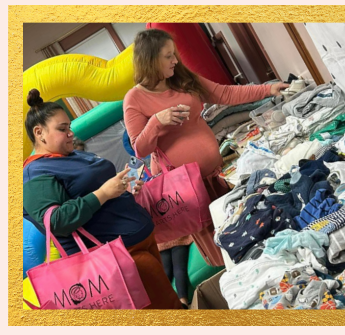
Maternal Care CHW Program This pilot program provides on-site support at prenatal appointments.

MSH Podcast launch: A Mother Like No Other Check out our new parenting podcast. New season coming soon!